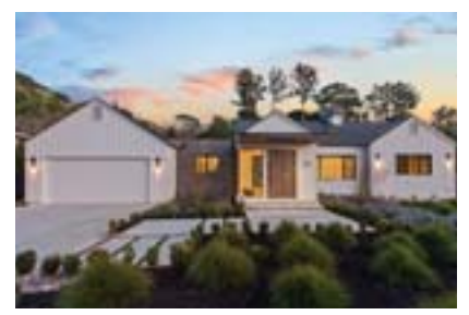
1182 Glen Road, Lafayette Offered at $3,595,000 4 Bedrooms, 4 Bathrooms, 3,675 sf, .41 acre lot