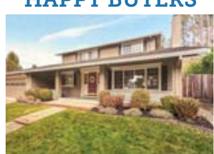
112 Walford Dr., Moraga Sold for $1,530,000 4 Bedrooms, 3 Bathrooms, 2,410 sf, .23 acre lot

Matt McLeod, REALTOR® 925.464.6500 · matt@dudum.com DRE 01310057