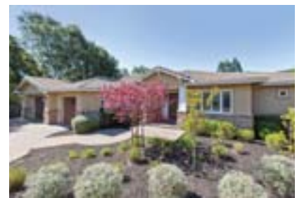
11 Candlelight Ln., Moraga Offered at $2,195,000 4 Bedrooms, 4 Bathrooms, 3,262 sf, 1.08 acre lot