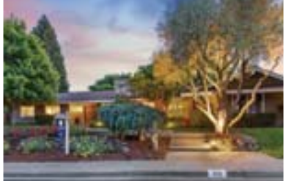
472 Kingsford Dr., Moraga Offered at $1,549,000 4 Bedrooms, 3 Bathrooms, 2,405 sf, .46 acre lot