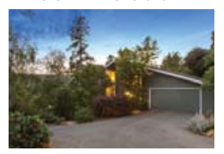
11 Ketelsen Court, Moraga Call Matt for Price 4 Bedrooms. 2.5 Bathrooms. 2,410 sf, .27 acre lot