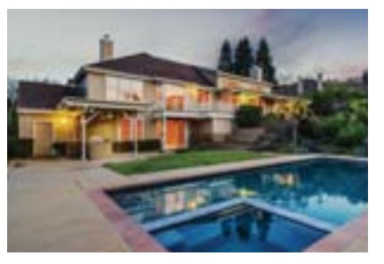
Sold for $2,100,000 5 Bedrooms, 4 Bathrooms, 4,251 sf. .68 acre flat lot