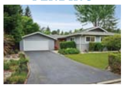
5 Buckingham Dr., Moraga Offered at $988,800 3 Bedrooms, 2 Bathrooms, 1,364 sf, .23 acre lot